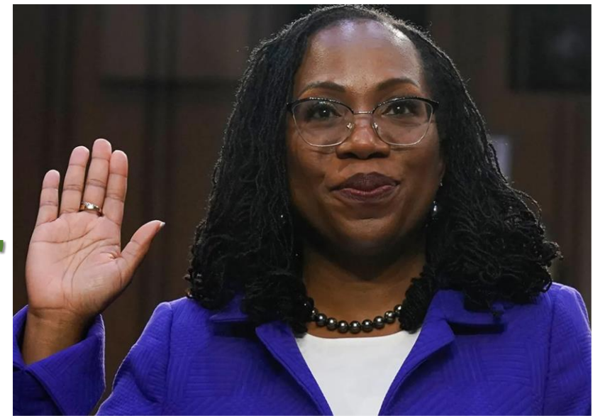
Judge Ketanji Brown-Jackson