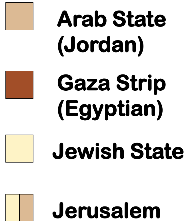
Armistice Lines, 1949