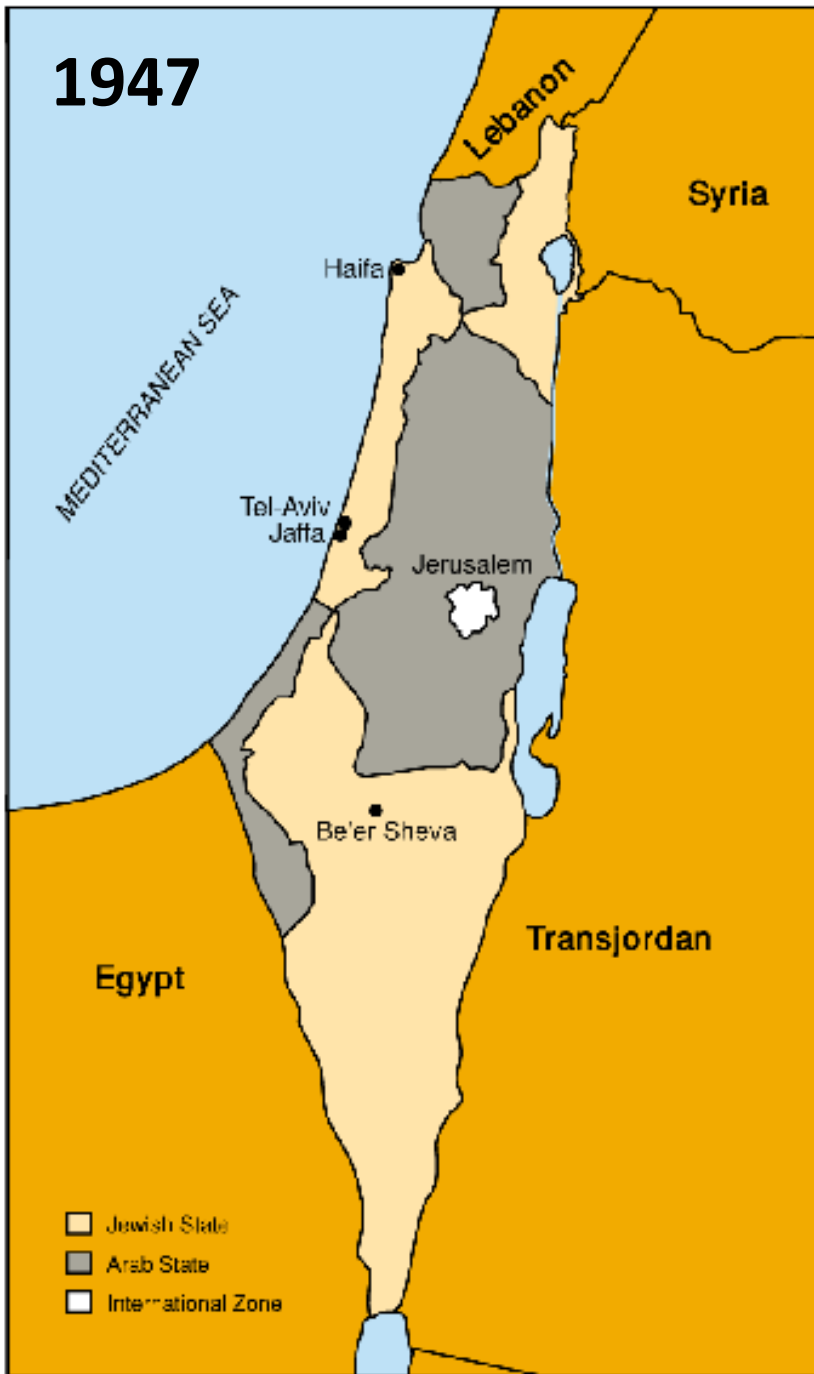
The Partition Plan, 1947 U.N. General Assembly Resolution 181