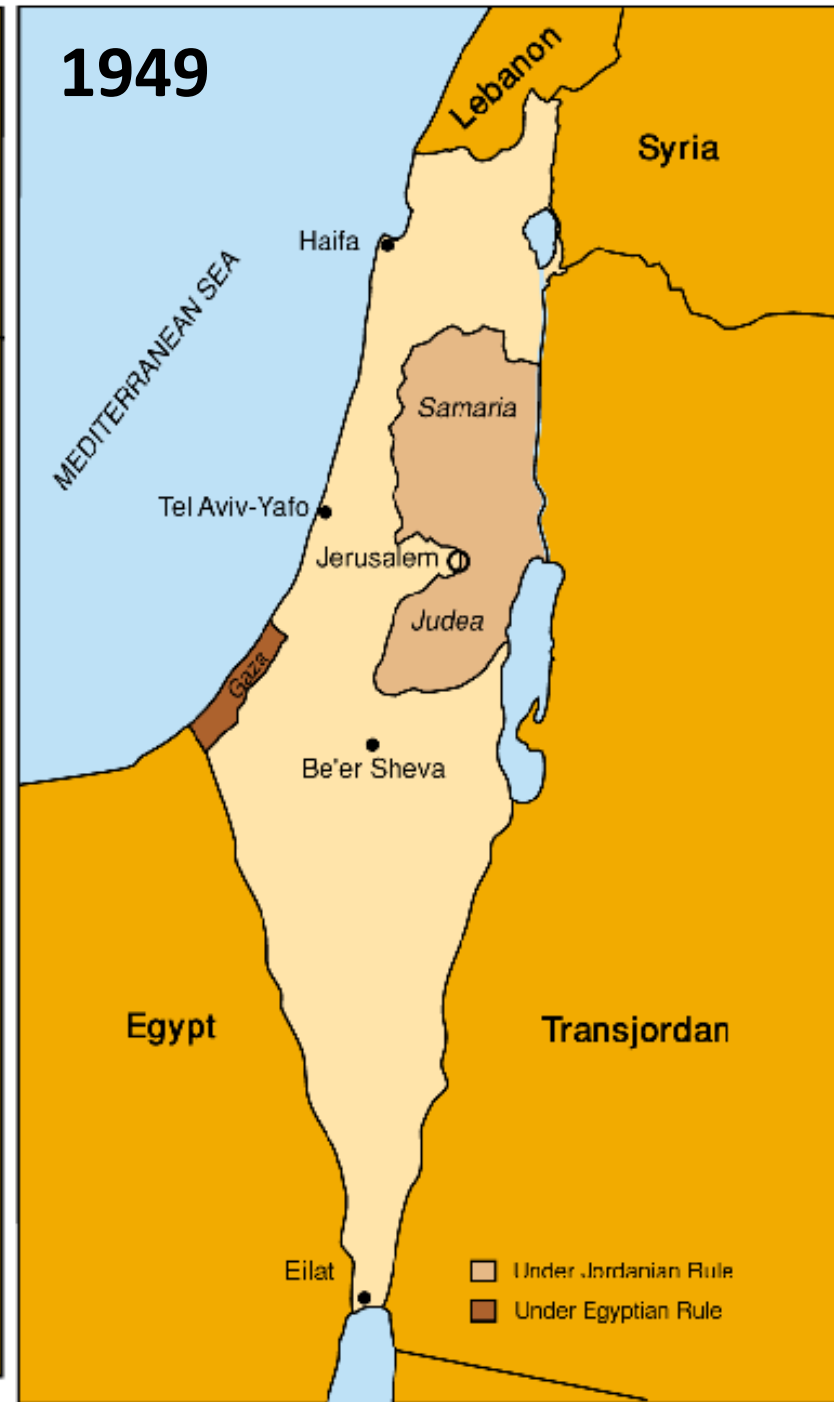
Armistice Lines, 1949